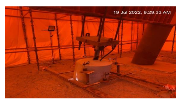
Routine Testing at Lab