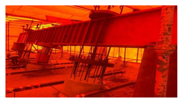
Compression Testing at Lab