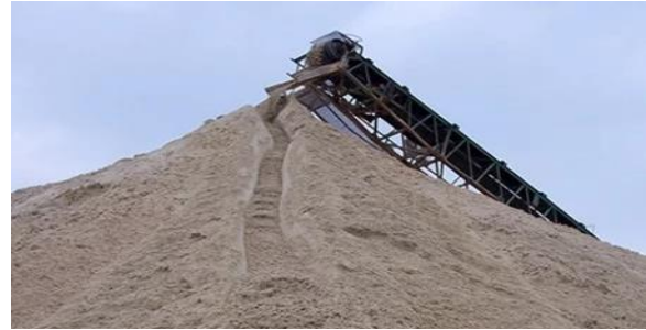
Fig 1: M Sand

Thus, the cost of construction can be controlled by the use of manufactured sand as an alternative material for construction. The other advantage of using M-Sand is, it can be dust free, the sizes of m-sand can be controlled easily so that it meets the required grading for the given construction.