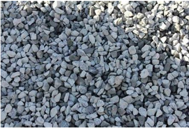
INTRODUCTION OF EGG SHELL & STEEL SLAG EGG SHELL

Every construction industry wants a wasteful and efficient waste product that can significantly reduce the use of cement and ultimately reduce construction costs. It is widely known that agricultural waste makes up the bulk of the garbage collected in many cities of the world. Egg shells are part of the agricultural waste that pollutes the environment. Egg shells are known to have good energy properties when mixed with concrete. Calcium-rich egg shell is a chicken dung that contains a chemical similar to limestone. The egg shell is the hard outer shell of the egg. It contains calcium carbonate, a common calcium. Some are made up of proteins and other minerals.