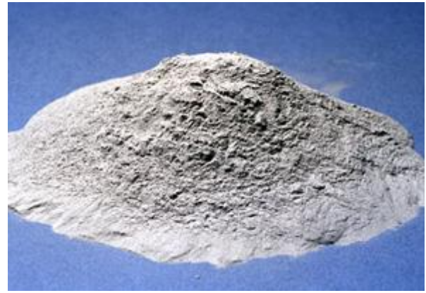
Fig 1: flyash cement

Flyash is defined in Cement and Concrete Terminology as “the finely divided residue resulting from the combustion of ground or powdered coal, which is transported from the firebox through the boiler by flue gases.” Flyash is a by-product of coal-fired electric generating plants. Flyash is one of three general types of coal combustion byproducts (CCBP’s). The use of these byproducts offers environmental advantages by diverting the material from the wastestream, reducing the energy investment in processing virgin materials, conserving virgin materials, and allaying pollution. Thirteen million tons of coal ash are produced in Texas each year. Eleven percent of this ash is used which is below the national average of 30 %. About 60 – 70% of central Texas suppliers offer flyash in ready-mix products. They will substitute flyash for 20 – 35% of the portland cement used to make their products. Although flyash offers environmental advantages, it also improves the performance and quality of concrete.